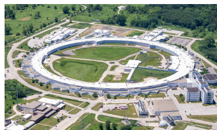
The eBERlight program aims to connect the world-leading X-ray facility with more scientists studying Earth's climate and environment.

eBERlight actively collaborates with other DOE Office of Science user facilities, such as the Environmental Molecular Science Laboratory (EMSL) at Pacific Northwest National Laboratory (PNNL) and the Joint Genome Institute (JGI) at Lawrence Berkeley National Laboratory (LBNL) and participates in the Facilities Integrating Collaborations for User Science (FICUS) program.